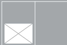
Double page spread