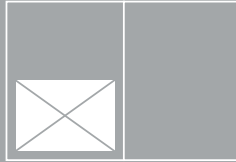
Half page landscape